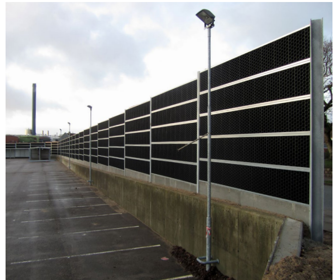
Noise absorbing side facing Tican Industries

The elements in the 3,5 meter high noise barrier contain acoustic absorbent material from recycled wind turbine blades in frames of galvanized steel.